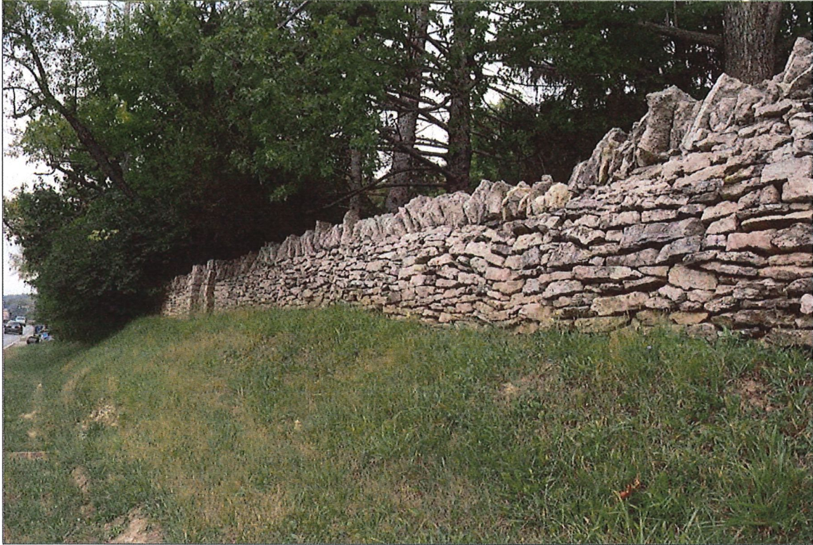
Figure 93. Example of taller wall with larger stones (Wall W005 along Riverside Drive, looking north)

Dublin's atypical stone walls appear to be related to individual property owner's preferences rather than any larger trend. In general, these walls tend to be along residential property boundaries, are mortared, and may feature rounded rather than tabular stone. A greater diversity of raw material types is also common. Figure 94 depicts one of the atypical stone walls of Dublin.