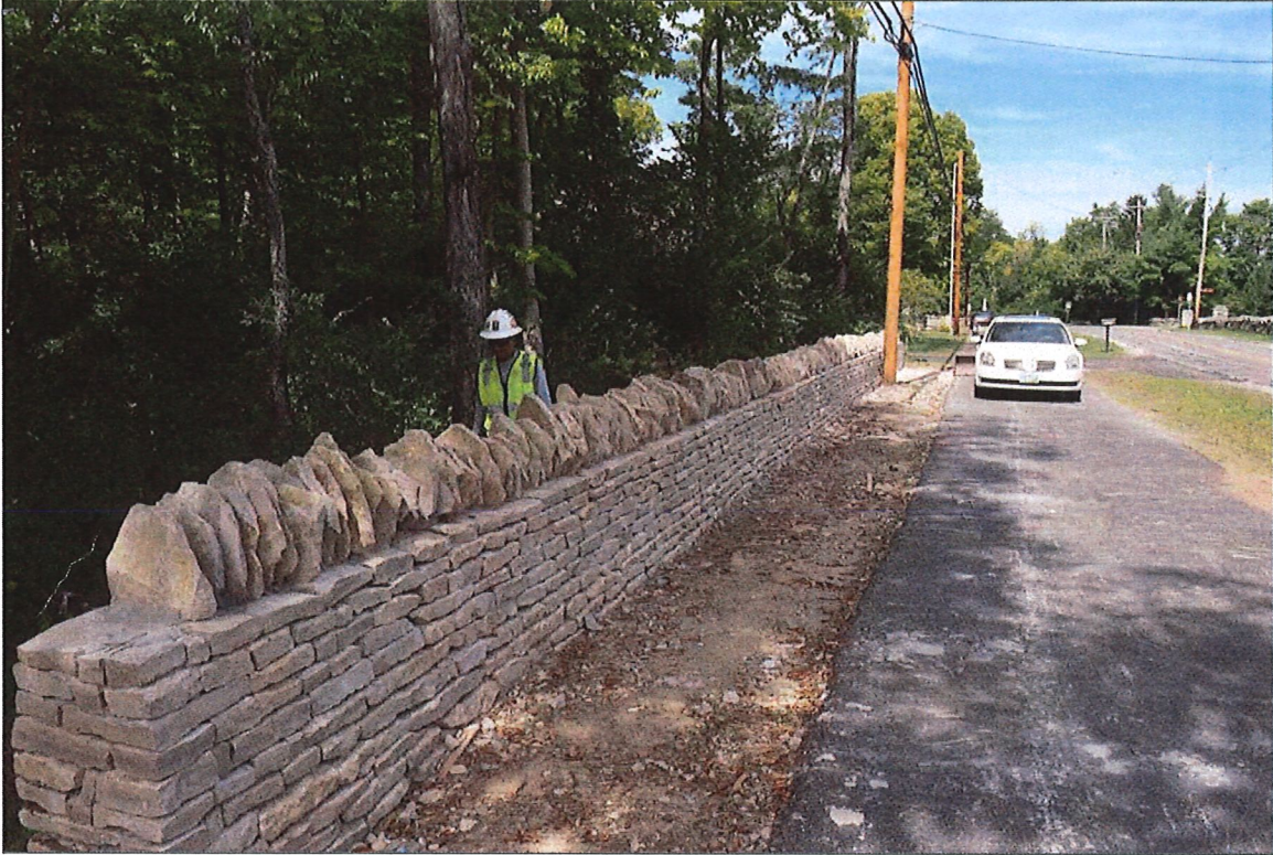
Figure 96. Wall in process of being rebuilt as part of trail project (W034 along west side of Dublin Road south of downtown, looking north). Note top course set in mortar.