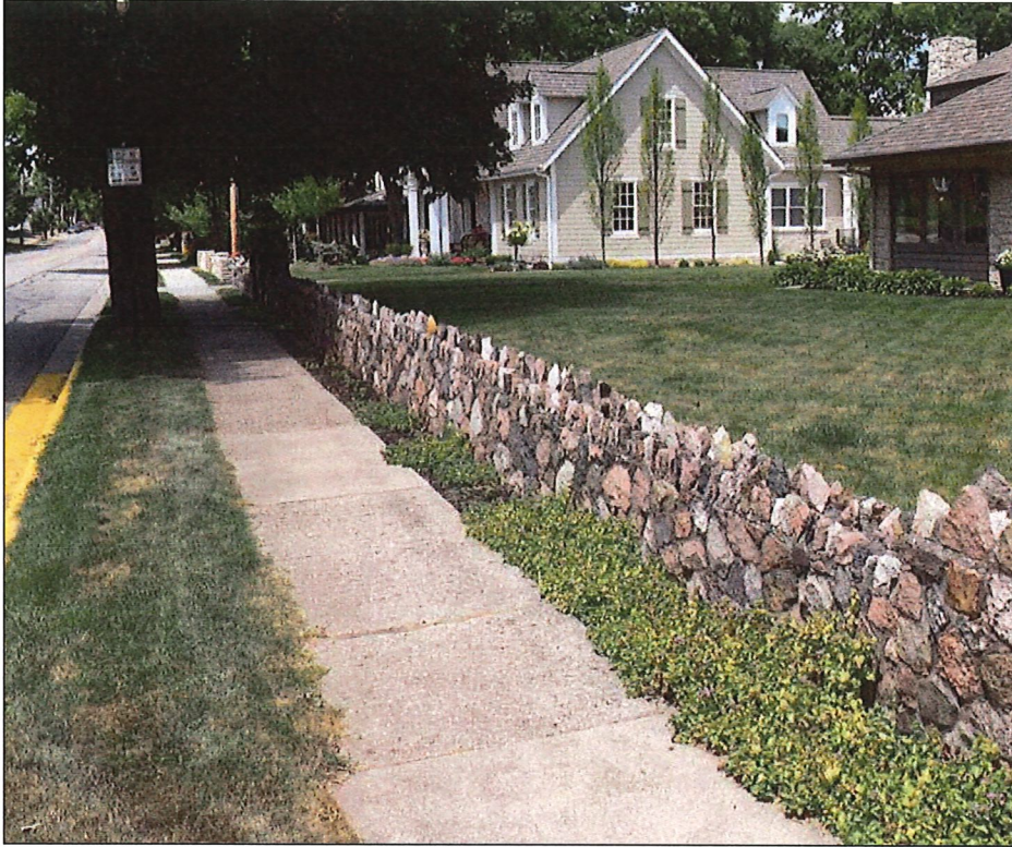
Figure 94. Example of an atypical stone wall (W065A) in front of 824 S. High Street, looking northeast