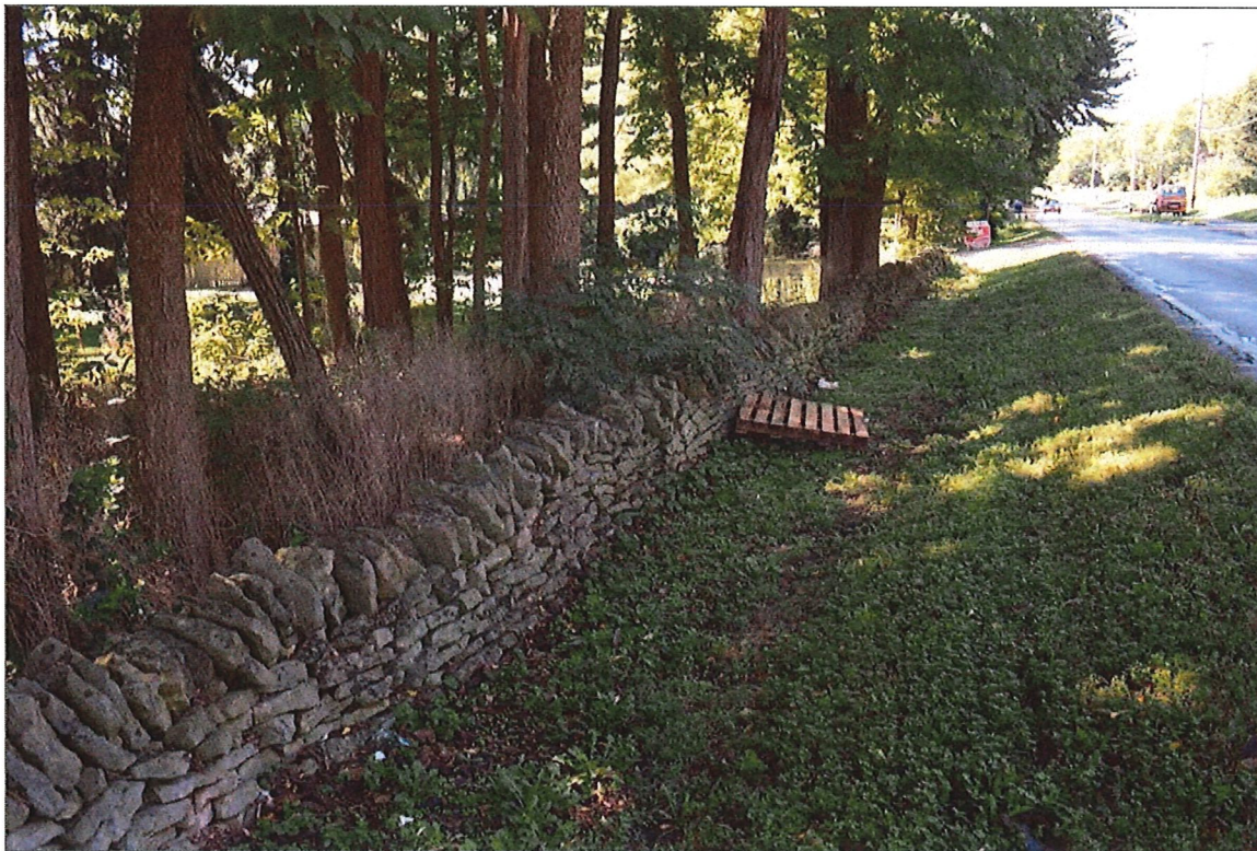
Figure 92. Example of lower wall with slightly smaller stones (Wall W033 along Riverside Drive, looking south)