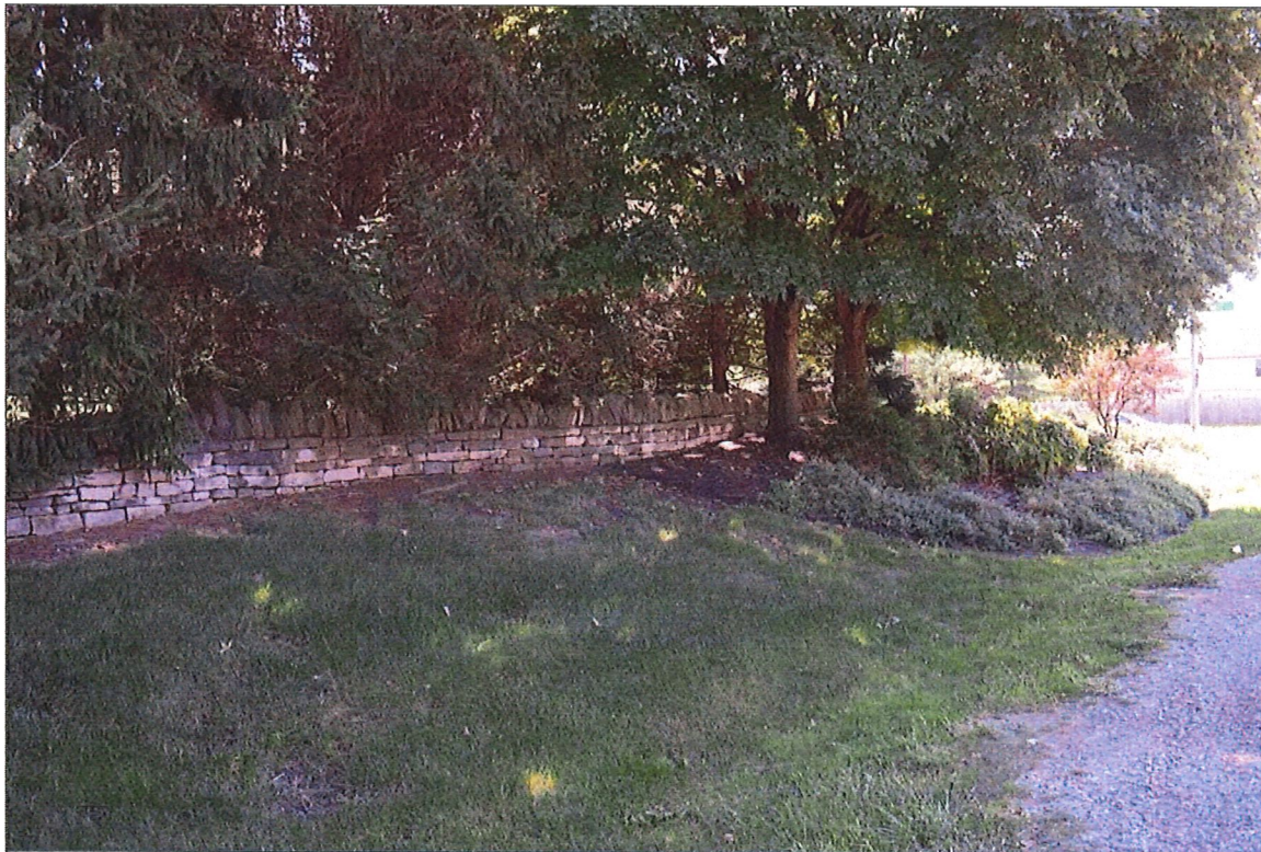
Figure 95. Modern wall with square, cut stones, near intersection of Dublin and Frantz Roads, looking southeast